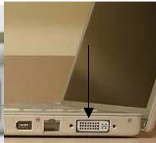
DVI: #3 Purple