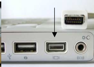
Mini-DVI: #2 Green