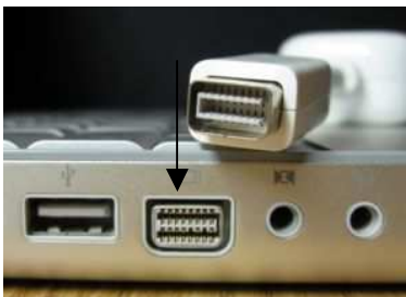
Mini-DVI: #1 Red