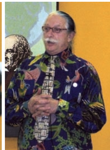
Patch Adams, MD

Our Mission: To educate and train physicians and practitioners in the art and science of natural medicine.