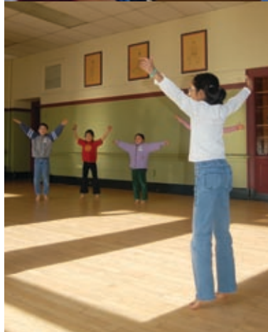
Kids exploring "Helfgott for a Day."