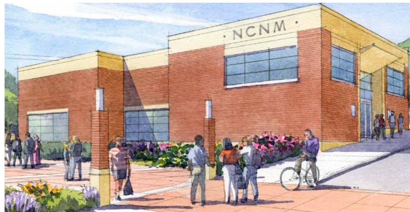
NCNM will develop a new student life and library complex adjacent to its integrated clinic.

These phases become the essential foundation blocks to grow the profession. By 2016, we plan to graduate 50% more physicians and Chinese medicine practitioners each year than we do today. In addition, credentialed, recognized, accredited continuing medical education in natural medicine will be offered to alumni and medical doctors, dentists, osteopaths, chiropractors, pharmacists, nurses and veterinarians — a first for NCNM. With appropriate accreditation approval, adding undergraduate program opportunities to NCNM — the defining feature of a university — will make it a major contender for students seeking degrees or graduate training in nutrition, herbal sciences, public health and wellness.