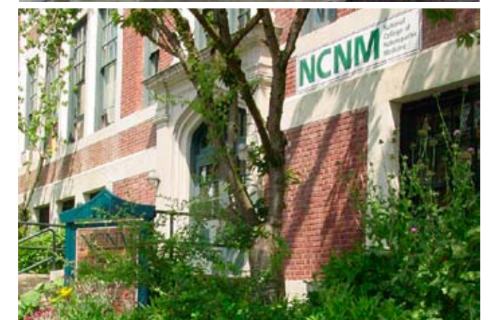
NCNM's main campus building was formerly a community college, and before that, an elementary school. Since 2007, we've added six classrooms, a new lecture hall, a new anatomy lab, an enhanced student lounge, bathrooms, student government spaces, outdoor pavilions and a healing garden.