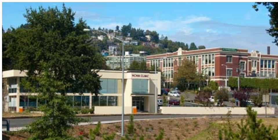
NCNM's new integrated clinic near the exit of the Ross Island Bridge ... a city block of natural health resources.

We imagine a magnificent, urban, green space where we can educate natural medicine practitioners and physicians who will move quickly to become the leaders in health care in their American communities and throughout the world. In September 2009, NCNM opened Oregon's largest natural medicine clinic where we are helping tens of thousands of patients deal with health issues using natural medicine modalities and medicines. In January 2011, NCNM opened its newest lecture hall at the northern boundary of the downtown college footprint.